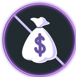
Their Care Costs