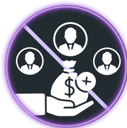
Their Creditors or Bankruptcy